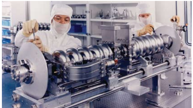
Nobium Cavity Pair Assembly in Clean Room

With these needs in mind, JLab administration searched for a system that could both control access and tie into their existing Human Resources/training database, which resides on their Central Information System, or CIS.