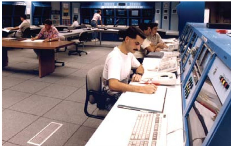
Machine Control Center (MCC)