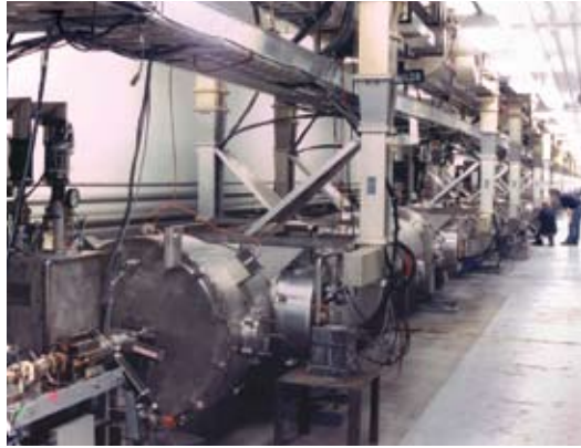
Cryomodules connected end-to-end around the accelerator tunnel

Kausch says Phase II plans for JLab's CANS will include the installation of additional card readers to control access to smaller areas within existing controlled areas, computer rooms, clean rooms and chemical rooms, and the machine shops. JLab is also taking a hard look at integrating digital video recording using TAC's digital CCTV system, DigitalSentry.